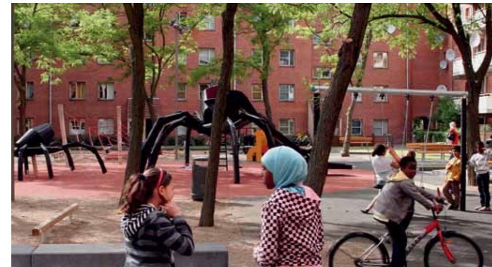
Top. WITRAZ arkitekter + landskab, recreational areas in Mjølnerparken, Copenhagen N, 2005-08 Center: Preben Skaarup, Stige Island, Odense C, 2005- Bottom. Vibeke Rønnow Landskabsarkitekter Aps, express way Århus-Låsby, 2005-08 Illustrations from the book

The book reflects a very high standard in Danish landscape architecture, so high that it is bound to attract international attention. ed.